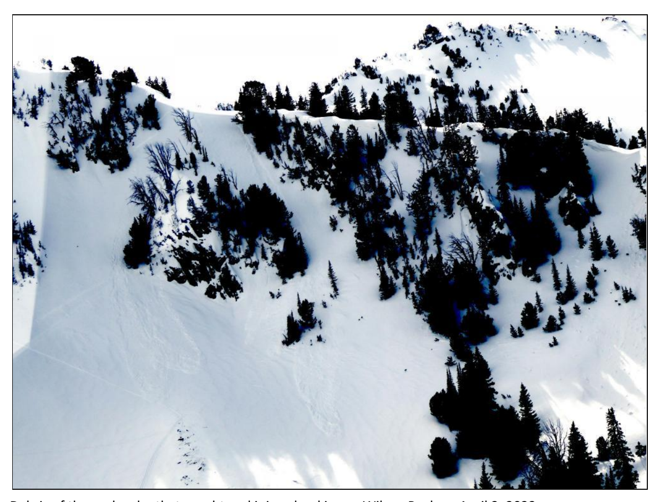
Debris of the avalanche that caught and injured a skier on Wilson Peak on April 3, 2022.