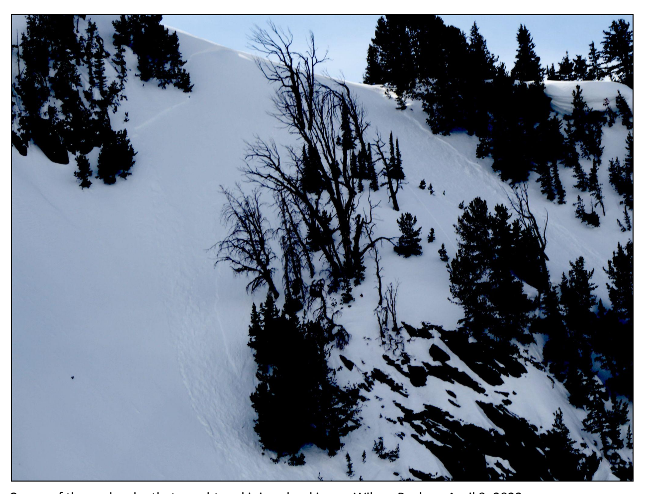
Crown of the avalanche that caught and injured a skier on Wilson Peak on April 3, 2022.